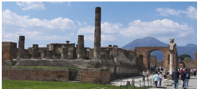
Forum in the City of Pompeii with Mt. Vesuvius in the background.

After breakfast, depart by private motor coach to Pompeii. Visit to Pompeii's ruins, an ancient city covered by volcanic lava over 2,000 years ago. Also visit the Shrine of Our Lady of the Rosary. We will also see breathtaking beauty as they travel the fascinating Amalfi Drive. First stop is the panoramic "Bellevue of Positano" where we can view the unique village of Positano. Continue to Amalfi passing the fishing villages of Praiano and Conca Dei Marini. In Amalfi, the group will visit St. Andrew's Cathedral, and then will have the rest of the afternoon free to explore the narrow city alleyways displaying Maiolica Tile art. Dinner and overnight in Sorrento.