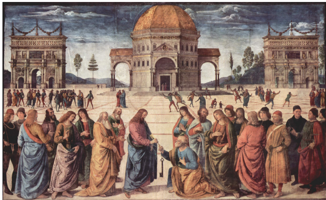
Fresco in St. Peter's Basilica in Rome

Following breakfast we will enjoy a guided tour of St. Peter's Basilica, and the world famous Vatican Museums, featuring a visit to the Sistine Chapel. The remainder of the day is at leisure and overnight will be in Rome.