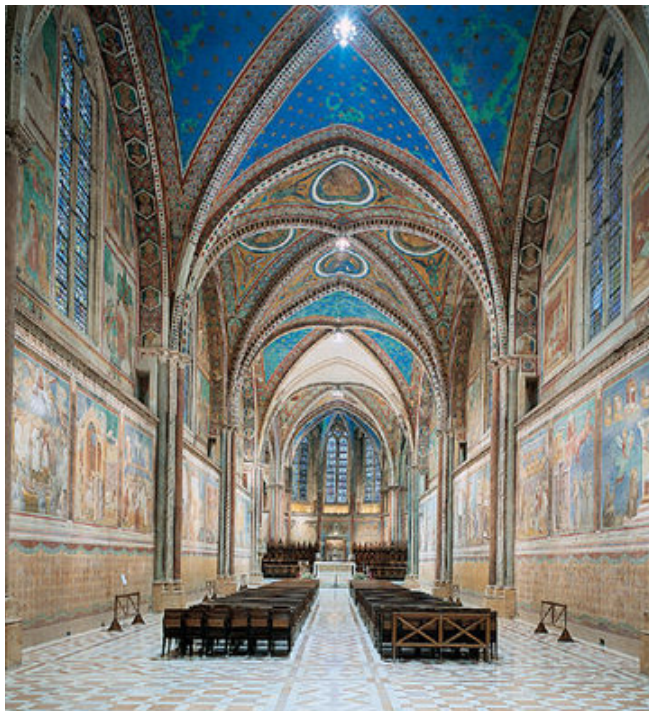
The Basilica of Assisi from the Interior