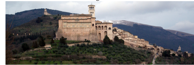
St. Francis of Assisi Basilica

Transfer to the city of Florence where you will enjoy panoramic views of the magnificent Arno. Visit the Duomo of Santa Maria del Fiore. Then we see the Baptistery of San Giovanni. Dinner and overnight in Florence.