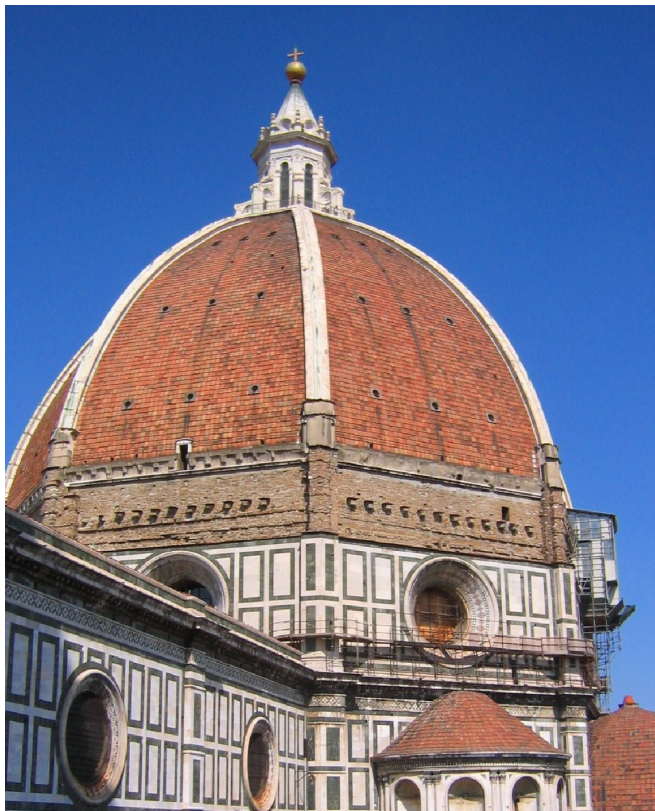
The Basilica of Florence