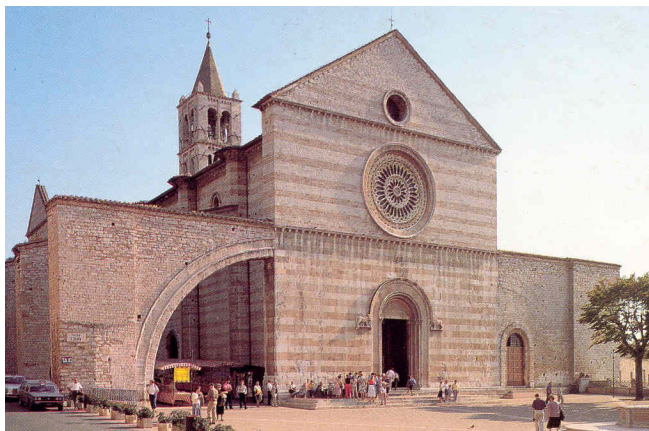
St. Francis Basilica