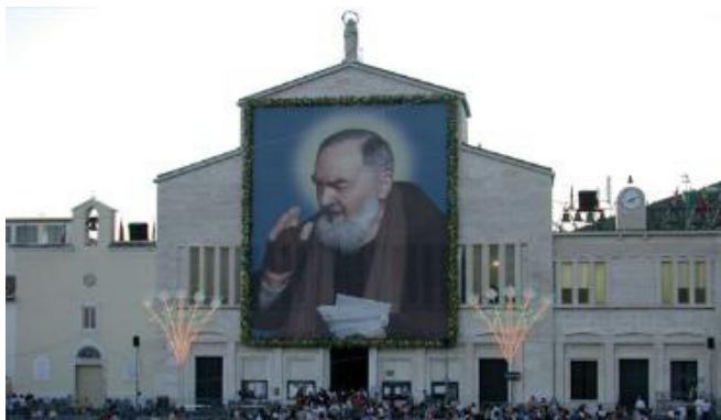
San Giovanni Rotondo

After breakfast, travel to Loreto. Visit the Holy House of Nazareth and the beautiful Madonna of Loreto. Mass at the Shrine in Loreto, then transfer to Assisi. Stop at St. Mary of the Angels Basilica and see the Portiuncula Chapel. See also the Cappella del Transito that contains the cell where St. Francis died, along with the Thornless Rose garden. Dinner and overnight in Assisi.